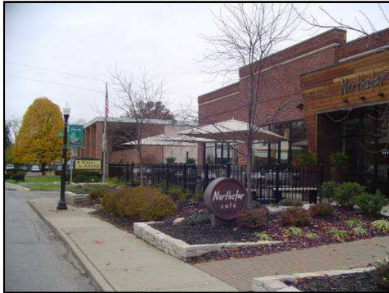
Above: Busy restaurant on N High St without on-street parking. Parking is located behind the building.

The photographs below show some parking examples for businesses throughout Columbus.