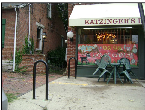
Left and right: Bike racks can be placed free of charge in front of businesses that request them.