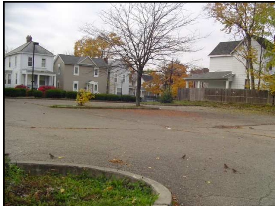
Left: Parking lot between Wayne and Oakley behind storefronts on W Broad St in the Hilltop. This lot is currently vacant weekday mornings, afternoons, and nights. Additional signs can be placed along W Broad St to guide customers to this lot.